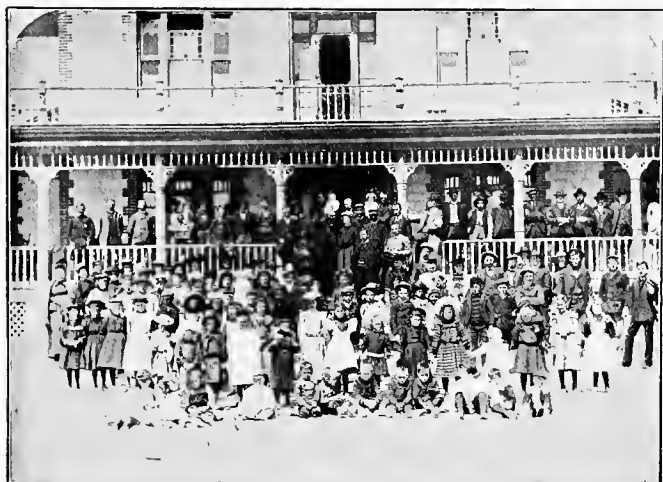
A GROUP OF COLONISTS, FORT AMITY.